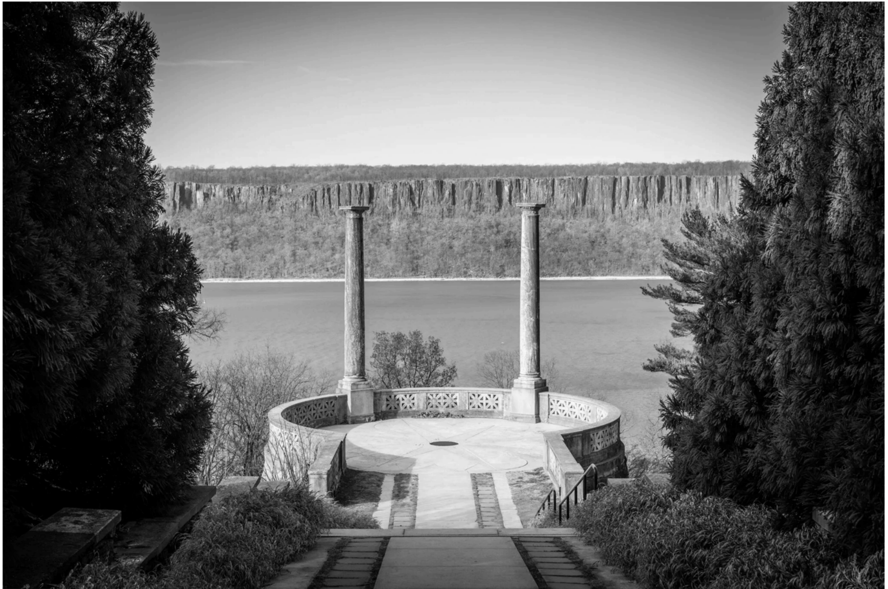
Untermyer Park and Gardens overlooks the Hudson River and the Palisades.