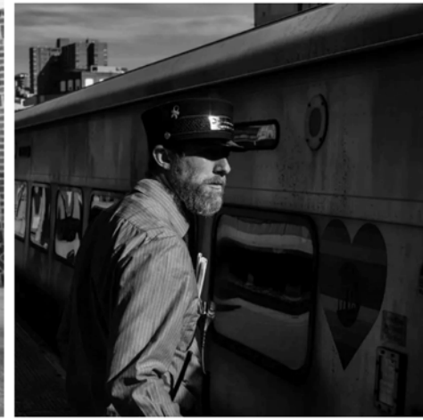
Yonkers Station serves Metro North and Amtrak trains.

Many depend on a car, but there are other options.