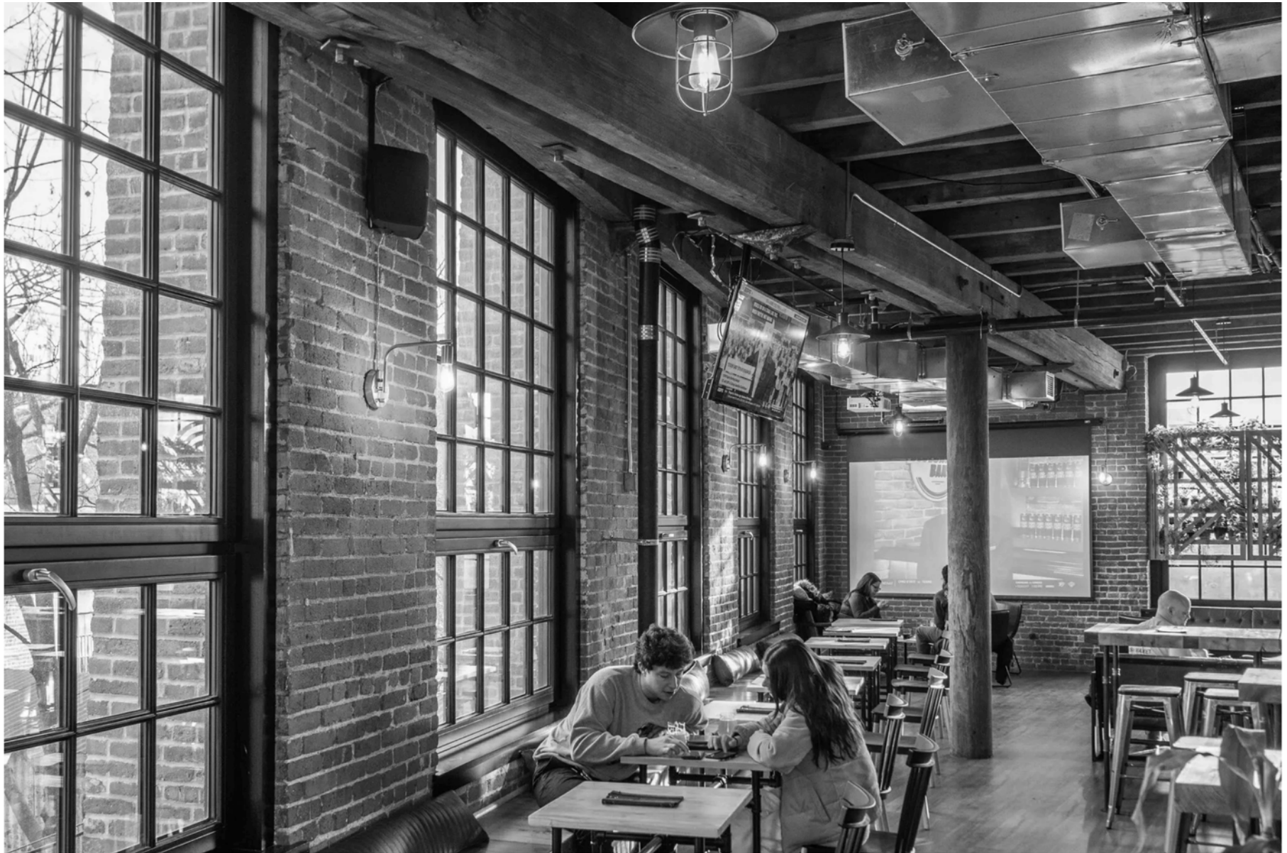
Simple Motive Brewing Company in the Alexander Smith Carpet Mills Historic District in Yonkers.

And as New York City housing costs increase, some residents are choosing Yonkers for its convenience and affordability. The downtown is a 30-minute Metro-North ride on the Hudson Line from Grand Central Terminal. Once there, large residential buildings on the banks of the Hudson River give way to single-family homes in other areas. New high-rises have popped up, with more under construction.