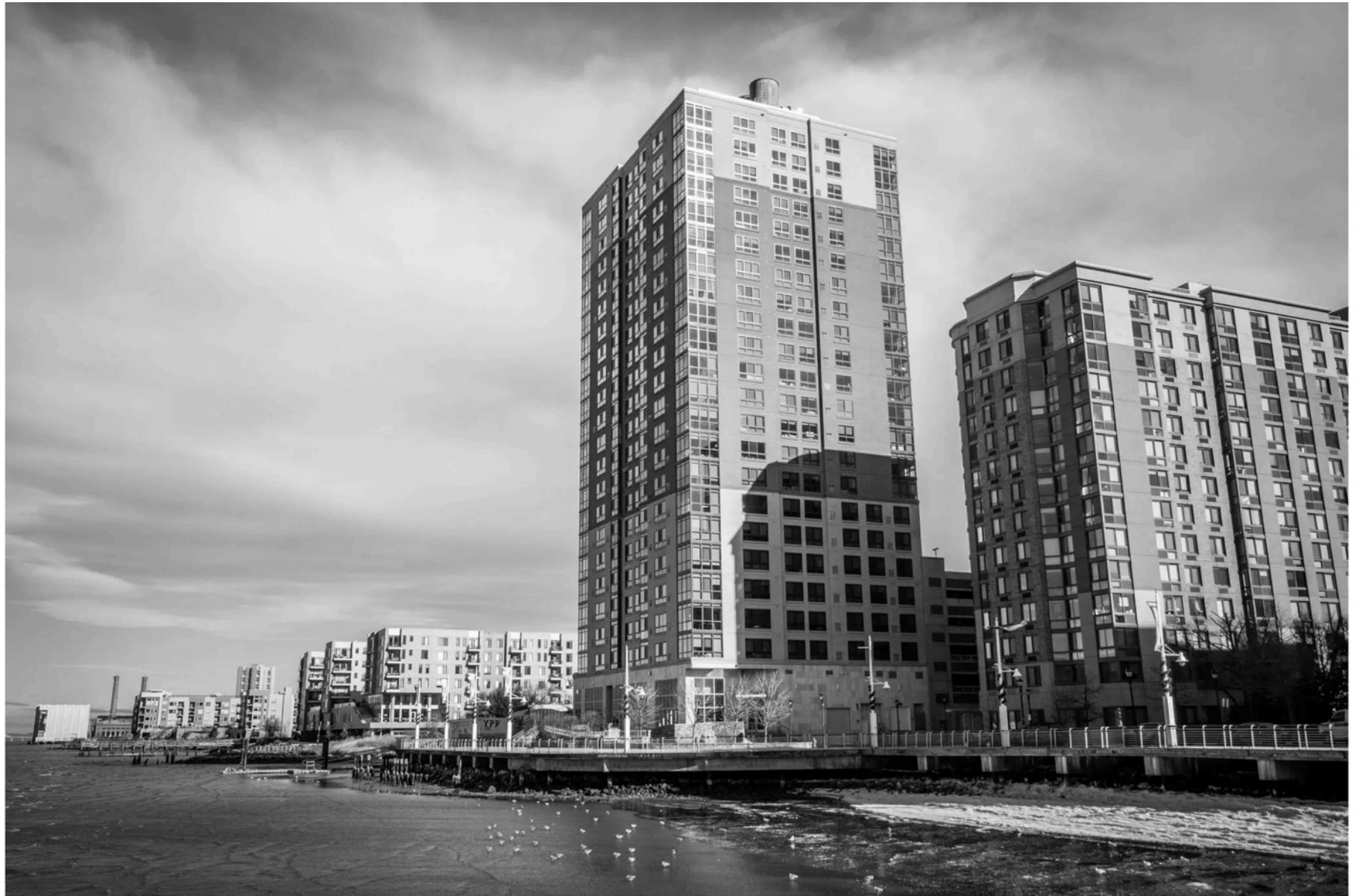
The downtown waterfront.

Since 2012, 12,500 new housing units have been built and 820 homes are slated for completion this year. Another 1,322 are in the review process, and likely to be completed within five years.