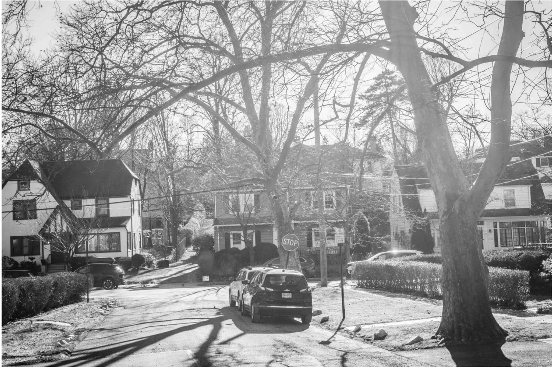
The Ludlow neighborhood

Homes range from single to multifamily, depending on the neighborhood.