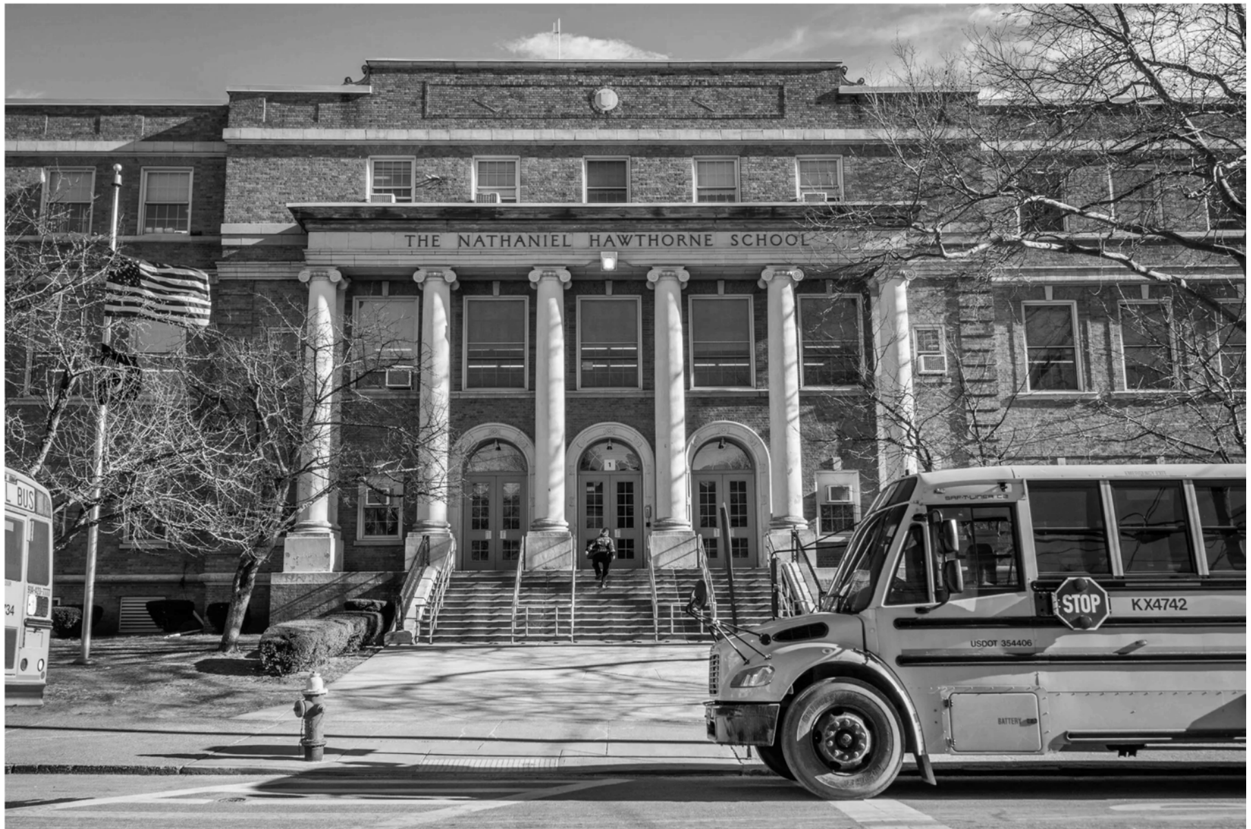
PEARLS Hawthorne School.